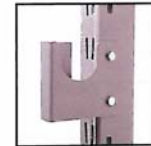
Left Side Shown