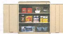
Counter Height Cabinet