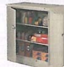
Counter Height Cabinet