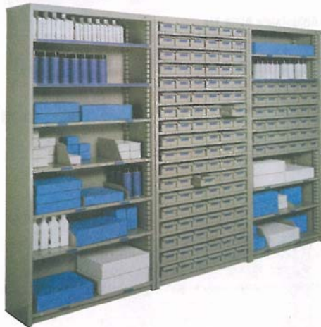
- Assembly required.

Tire Racks Standard Colors: Light Grey, Medium Grey, Sand QuickShip Colors: Medium Grey, Sand