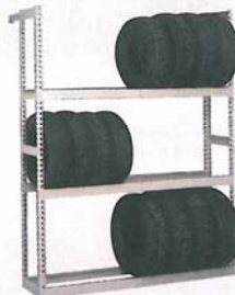
National Motor Freight classification: Class 70