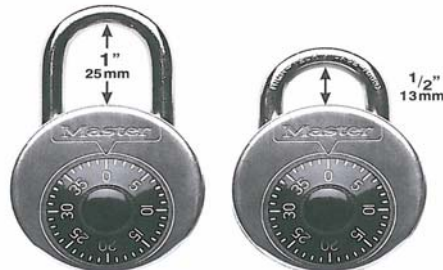
2002 or 2010