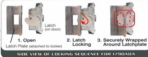
SIDE VIEW OF LOCKING SEQUENCE FOR 1790ADA

Uses same technology as automotive door lock systems