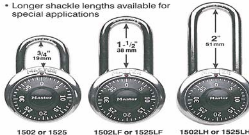
1502 or 1525